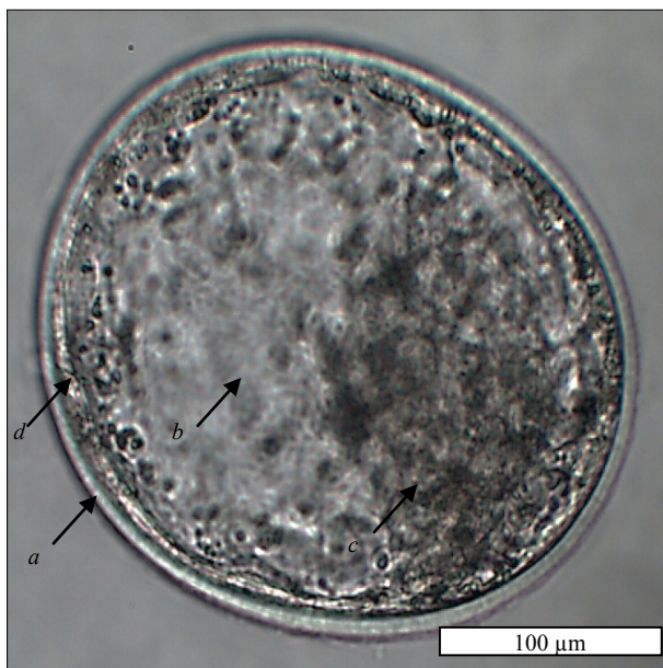
Fig. 4. Fully re-expanded cavity of cattle blastocyst on the 24th h after thawing: zona pellucida (a), blastocyst cavity (b), inner cell mass (c), trophoblast (d)

As with the equilibration period, the protocols of commercial kits recommend it being dependent on recovery of embryo form, which could be evaluated by visualization under stereomicroscope. However, in practice, during embryo vitrification at the blastocyst stage, as well as morule, it is often hard to evaluate whether decrease or expansion has occurred, and additionally some blastocysts do not decrease in the vitrification solution. Study of this stage of vitrification is important, for it provides adequate survival of the embryo, hatching of blastocysts and level of nutrition (Martínez-Rodero et al., 2021), because prolonged action of equilibration solution can be harmful to the potential of development of embryo, while insufficient action may influence the permeation of cryoprotectants into