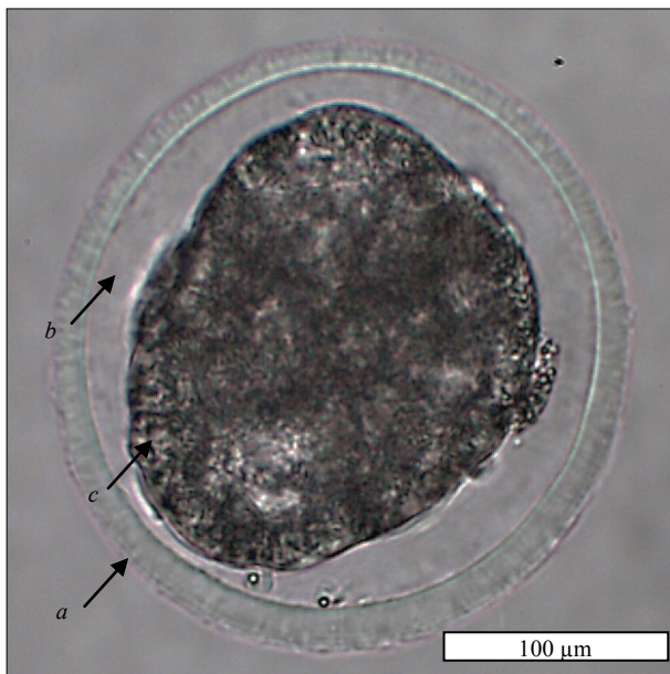
Fig. 3. Collapsed cavity of cattle blastocysts right after thawing: zona pellucida (a), subzonal space (b), cell mass (c)

vitrification solution with low concentration of cryoprotectant (usually double initial concentration) and the third – dehydration (usually, disaccharides are used, for example sucrose). Equilibration period varies broadly: it can be short (1 min) (Vieira et al., 2007; Sanches et al., 2016), last for 3 min (Gómez et al., 2020; Oliveira et al., 2020) or long (10–15 min) (Morató et al., 2010; Gutnisky et al., 2013).