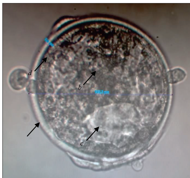
Fig. 2. Blastocyst of cattle prior to vitrification (cycle day – 7, stage code – 6, quality code – 1): zona pellucida (a), blastocyst cavity (b), inner cell mass (c), trophoblast (d)

The next steps lasted over 25 s, but no longer than 90 s. After the equilibration, embryo aspiration was performed with a small amount of equilibration solution and transferred to another well (vitrification solution), descending the embryo on the middle depth of the solution. The pipette was rinsed from the solution. The embryo in this solution surfaced, and therefore it was 5–6 times suctioned with pipette and put onto the bottom of the well.