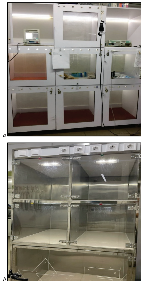
Fig. 1. Boxes for holding veterinary patients: a – plastic, b – stainless steel

colonies and determined the mean number in 1 mL of the rinse. To isolate microorganisms from the rinses, we performed inoculations on the media. In particular, Staphylococcus and Micrococcus were isolated on blood agar containing 5% sodium chloride, Enterococcus on Bile Esculin Azide Agar medium, Streptococcus and Corynebacterium on Streptococcus Selective Agar (HiMedia, India) and blood agar. Bacteria of Bacillus genus were identified by inoculating the rinses and their dilution on MPA with following incubation in the temperature of 30 °C for 72 h. The samples were previously held for 10 min in a water bath, in the temperature of 85 °C. Fungi were inoculated on the Saburo medium (Farmaktyv, Ukraine). Enterobacteriaceae ( Escherichia , Enterobacter , Citrobacter , Klebsiella , and others) were cultivated on Endo, Ploskiriev's and Levin's media (Farmaktyv, Ukraine). Isolation of Pseudomonas was performed on an acetamide-containing medium, and other non-fermentative bacteria ( Acinetobacter spp. and Alcaligenes spp.) on MPA, incubated for 7 days in 10 °C.