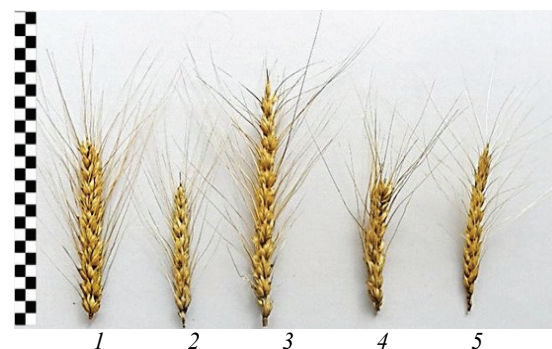
Fig. 2. Mutations according to the morphology of the ear in winter wheat of Albatros Odesky variety, induced in the Chornobyl Alienation Zone: 1 – initial form of the ear, 2 – short ear, 3 – long ear, 4 – squarehead ear, 5 – speltoid ear

density of radionuclide contamination. Therefore, mutations such as glaucous ear, anthocyanin leaves and awns, were found only among plants of Albatros Odesky variety, with frequency equaling respectively 1.01–1.25%, 0.20–0.83% and 0.40–1.66%. Mutation of early maturation, characteristic for Zymoarka variety, was seen with 0.19–0.63% frequency. Among the types of mutations in Albatros Odesky plants induced by radionuclide contamination in the territories of Chystohalivka village, we distinguished a number of original noticeable inherited changes, including speltoid ear (0.42%), red anthers (0.42%), wide (0.83%), narrow (0.42%) and light green (0.83%) leaves. Erectoid ear mutation (0.20%) was also found in plants of this species, but in the conditions of influence of radionuclide contamination in Kopachi village. In winter wheat plants of Zymoarka variety, the heightened radioactive background of radionuclide-contaminated territories induced a significantly narrower range of mutant types, including such an untypical mutation as absence of waxy layer (0.20%), caused by radiation impact developed in the territory of Kopachi village.