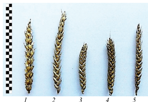
Fig. 4. Mutations according to the morphology of the ear of winter wheat of Zymoarka variety, induced in the Chornobyl Alienation Zone: 1 – initial form of the ear, 2 – long ear, 3 – short dense ear, 4 – squarehead ear, 5 – speltoid ear