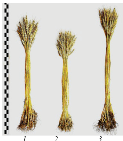
Fig. 5. Mutations in stem length among plants of Albatros Odesky winter wheat, induced in the Chornobyl Alienation Zone: 1 – initial length of the stem, 2 – low height, 3 – tall height

As a result of the analysis of the spectrum of noticeable mutations in M_2 – M_3 generations of the plants, we found plants and some samples with multiple combinations of discovered traits. Among them, we distinguish