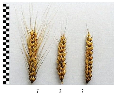
Fig. 3. Mutations of awns of the ear of winter wheat of Albatros Odesky variety, induced in the Chornobyl Alienation Zone: 1 – awned ear of the initial form, 2 – semi-awned ear, 3 – awnless ear