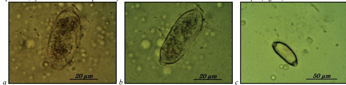
Fig. 2. Morphological changes of non-invasive Aonchotheca bovis eggs in test-culture, treated with glutaraldehyde and benzalkonium chloride mixture: a – envelope destruction, b – embryo loosening and decay, c – embryo dissolution